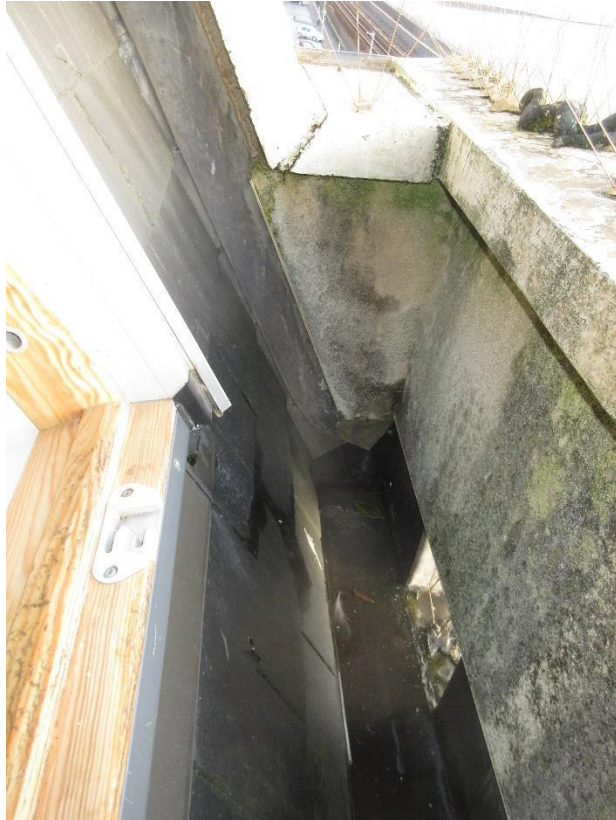
Fig.3 Parapet box-gutter lining appears to be partially collapsed and leaking, saturating the concrete floor of the flat.