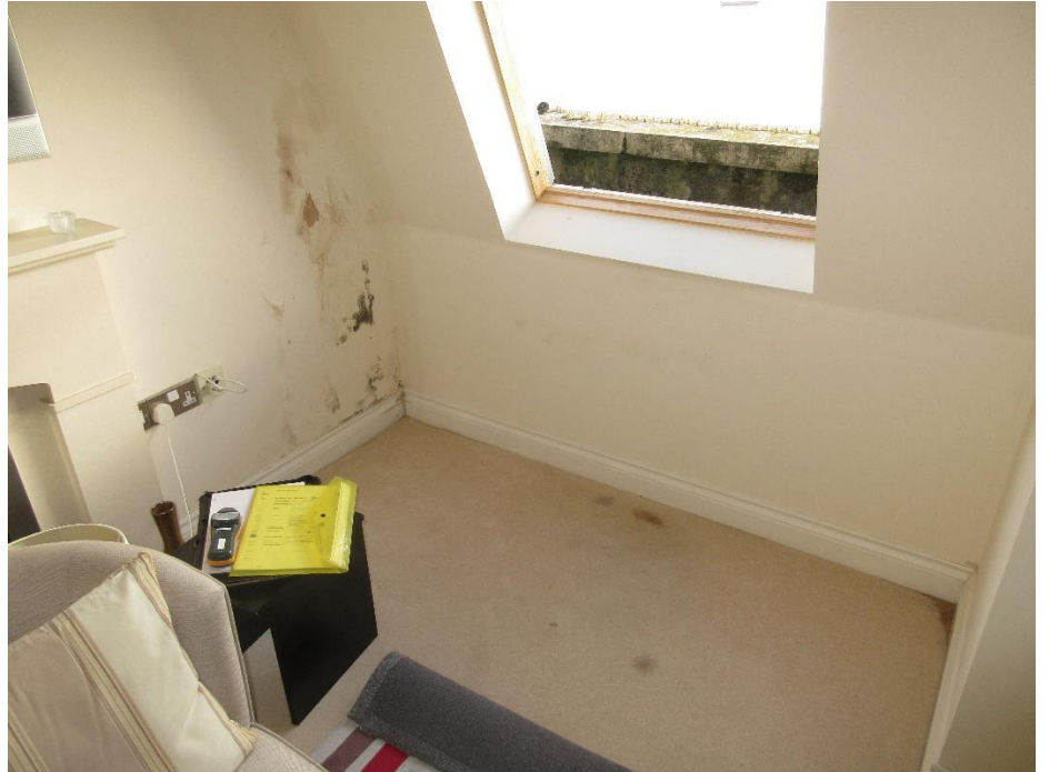
Fig.1 Damp damage in Flat 20